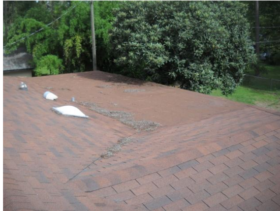
Bitumen roll roof at rear patio room