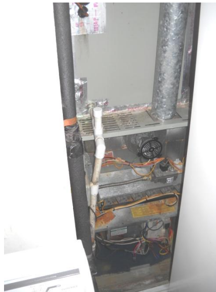
Gas furnace in laundry room