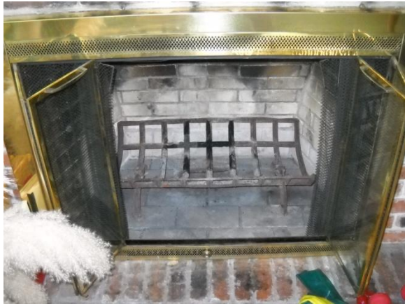
Fireplace is in good shape