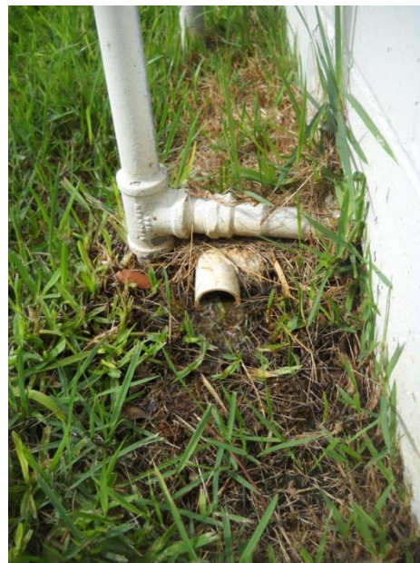
Dryer vent and condensation line terminate too close to grade (east side of home)