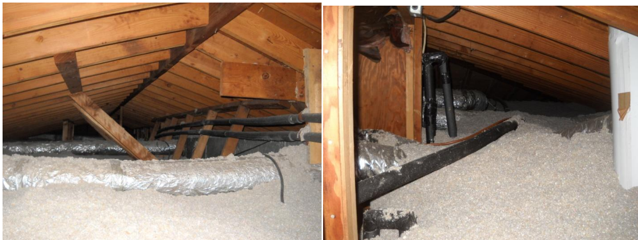
R-19 to R-30 loose-fill wood fiber insulation in attic - Properly insulated CPVC re-pipe through attic