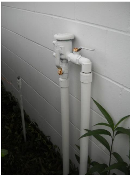
Backflow preventer at SW exterior wall -