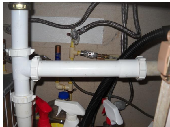
Whole house re-pipe with CPVC