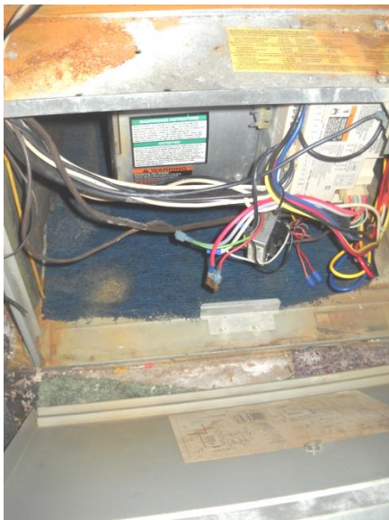
Washable AC filter at furnace -