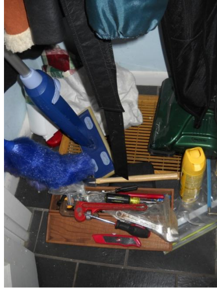
- Need to keep floor returns clear