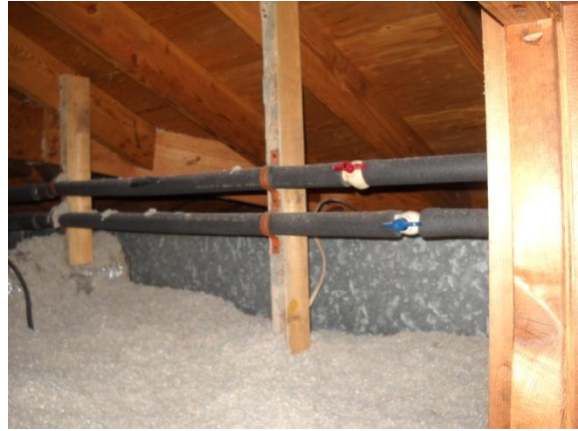
Shut-off valves in attic above laundry room