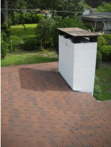
Block chimney is capped and screened -