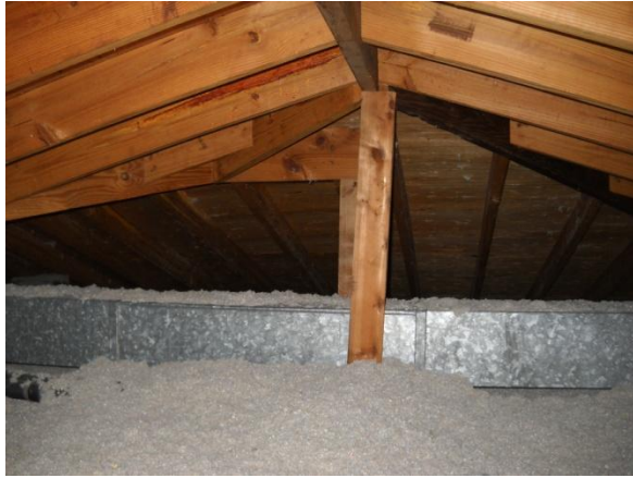
Rafter system for roof