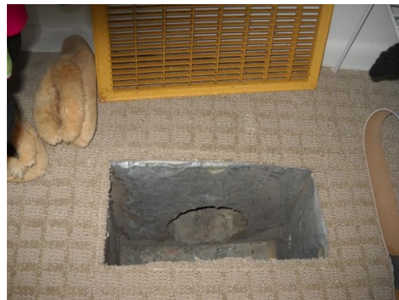
Return vents through slab at closets